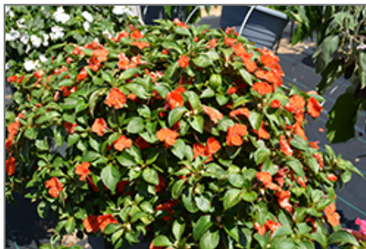
Beacon Orange Impatiens in bloom