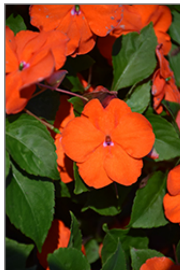
Beacon Orange Impatiens flowers

Beacon Orange Impatiens is recommended for the following landscape applications;