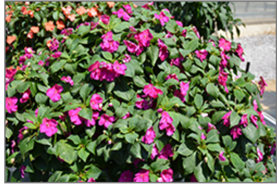
Beacon Violet Shades Impatiens in bloom

Beacon Violet Shades Impatiens will grow to be about 15 inches tall at maturity, with a spread of 12 inches. When grown in masses or used as a bedding plant, individual plants should be spaced approximately 8 inches apart. Its foliage tends to remain dense right to the ground, not requiring facer plants in front. This fast-growing annual will normally live for one full growing season, needing replacement the following year.