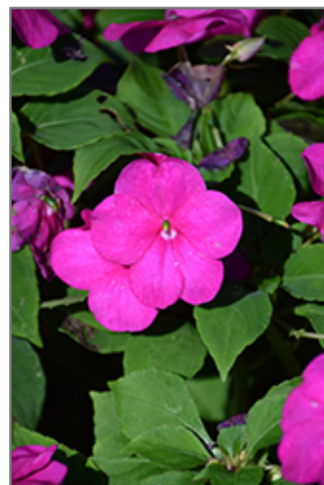
Beacon Violet Shades Impatiens flowers