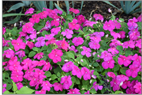
Beacon Violet Shades Impatiens flowers

Beacon Violet Shades Impatiens will grow to be about 15 inches tall at maturity, with a spread of 12 inches. When grown in masses or used as a bedding plant, individual plants should be spaced approximately 8 inches apart. Its foliage tends to remain dense right to the ground, not requiring facer plants in front. This fast-growing annual will normally live for one full growing season, needing replacement the following year.