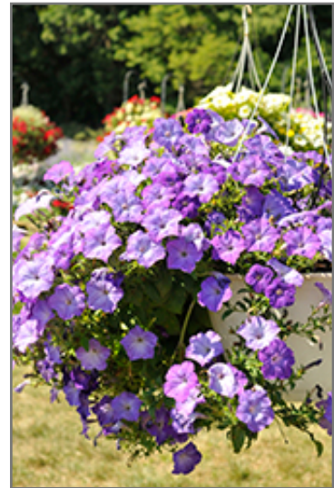
Easy Wave Lavender Sky Blue Petunia in bloom

Easy Wave Lavender Sky Blue Petunia is a fine choice for the garden, but it is also a good selection for planting in outdoor containers and hanging baskets. Because of its trailing habit of growth, it is ideally suited for use as a 'spiller' in the 'spiller-thriller-filler' container combination; plant it near the edges where it can spill gracefully over the pot. Note that when growing plants in outdoor containers and baskets, they may require more frequent waterings than they would in the yard or garden.