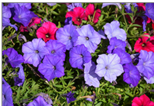
Easy Wave Lavender Sky Blue Petunia flowers