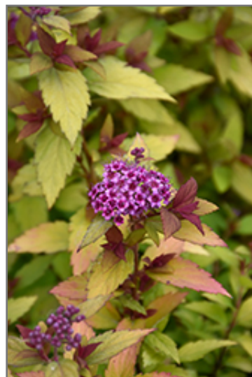
Poprocks Rainbow Fizz Spirea flowers