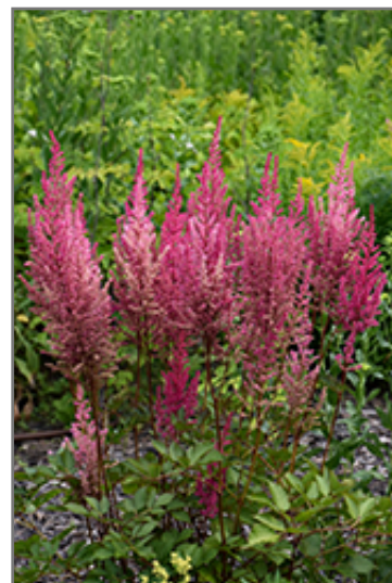
Mighty Chocolate Cherry Chinese Astilbe flowers

Mighty Chocolate Cherry Chinese Astilbe is recommended for the following landscape applications;