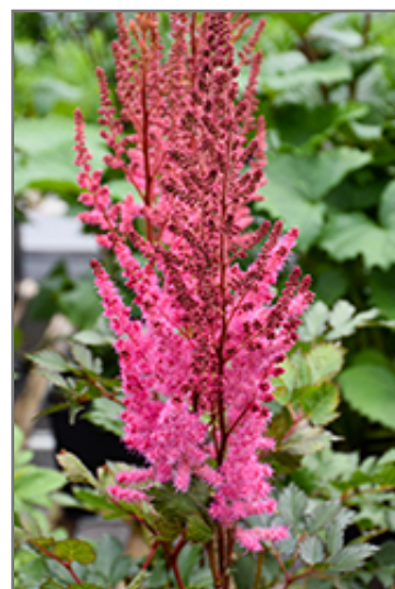
Mighty Chocolate Cherry Chinese Astilbe flowers