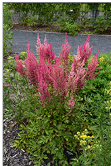
Mighty Chocolate Cherry Chinese Astilbe in bloom

Mighty Chocolate Cherry Chinese Astilbe is a fine choice for the garden, but it is also a good selection for planting in outdoor pots and containers. With its upright habit of growth, it is best suited for use as a 'thriller' in the 'spiller-thriller-filler' container combination; plant it near the center of the pot, surrounded by smaller plants and those that spill over the edges. It is even sizeable enough that it can be grown alone in a suitable container. Note that when growing plants in outdoor containers and baskets, they may require more frequent waterings than they would in the yard or garden.