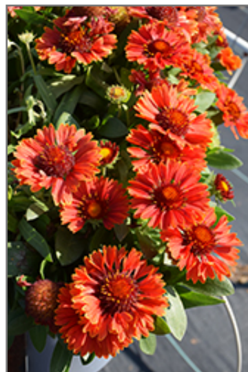
SpinTop Yellow Touch Blanket Flower flowers

SpinTop Yellow Touch Blanket Flower is a dense herbaceous perennial with a mounded form. Its relatively fine texture sets it apart from other garden plants with less refined foliage.