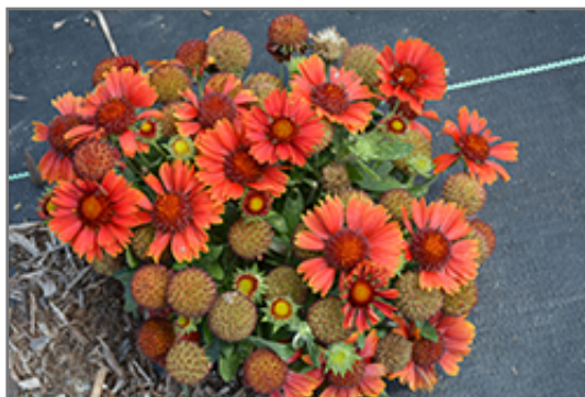
SpinTop Yellow Touch Blanket Flower in bloom

SpinTop Yellow Touch Blanket Flower is a fine choice for the garden, but it is also a good selection for planting in outdoor pots and containers. It is often used as a 'filler' in the 'spiller-thriller-filler' container combination, providing a mass of flowers against which the thriller plants stand out. Note that when growing plants in outdoor containers and baskets, they may require more frequent waterings than they would in the yard or garden.