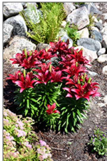
Lily Looks Tiny Rocket Lily in bloom