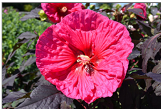
Summerific Evening Rose Hibiscus flowers