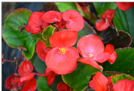
Topspin Scarlet Begonia flowers

Topspin Scarlet Begonia is recommended for the following landscape applications;