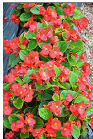
Topspin Scarlet Begonia in bloom