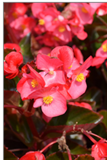
Viking Rose on Bronze Begonia flowers

Viking Rose on Bronze Begonia is recommended for the following landscape applications;