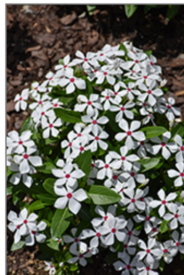
Soiree Kawaii White Peppermint Vinca flowers

Soiree Kawaii White Peppermint Vinca is recommended for the following landscape applications;