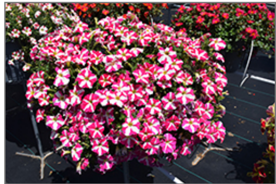
Amore Pink Heart Petunia in bloom