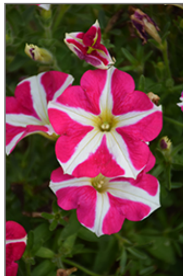
Amore Pink Heart Petunia flowers