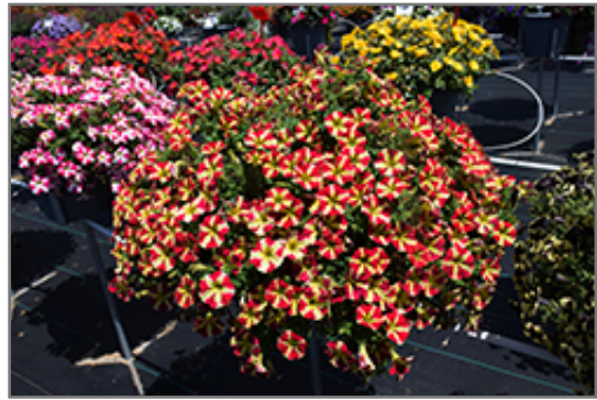
Amore Queen of Hearts Petunia in bloom

Amore Queen of Hearts Petunia is a fine choice for the garden, but it is also a good selection for planting in outdoor containers and hanging baskets. It is often used as a 'filler' in the 'spiller-thriller-filler' container combination, providing a mass of flowers against which the thriller plants stand out. Note that when growing plants in outdoor containers and baskets, they may require more frequent waterings than they would in the yard or garden.