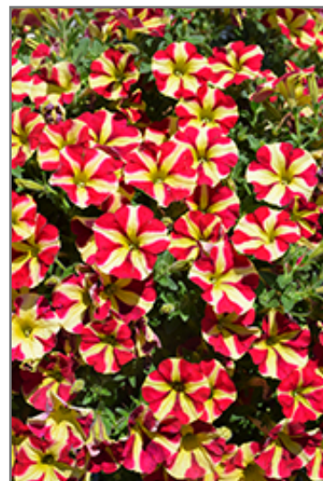
Amore Queen of Hearts Petunia flowers

This plant will require occasional maintenance and upkeep. Trim off the flower heads after they fade and die to encourage more blooms late into the season. It is a good choice for attracting butterflies and hummingbirds to your yard, but is not particularly attractive to deer who tend to leave it alone in favor of tastier treats. It has no significant negative characteristics.