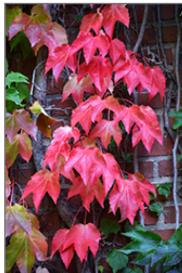
Boston Ivy in fall