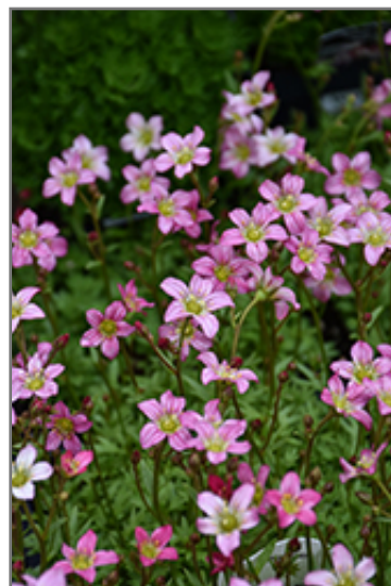
Touran Pink Saxifrage flowers

Touran Pink Saxifrage is recommended for the following landscape applications;