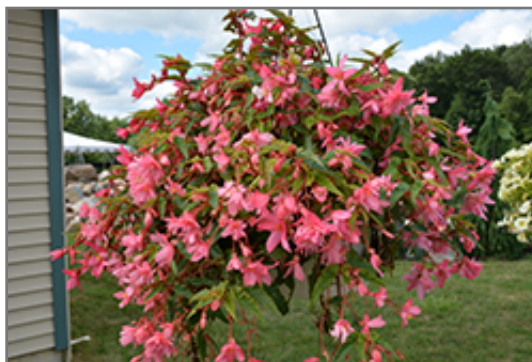
Funky Light Pink Begonia in bloom

This is a high maintenance plant that will require regular care and upkeep, and usually looks its best without pruning, although it will tolerate pruning. It is a good choice for attracting butterflies and hummingbirds to your yard, but is not particularly attractive to deer who tend to leave it alone in favor of tastier treats. Gardeners should be aware of the following characteristic(s) that may warrant special consideration;