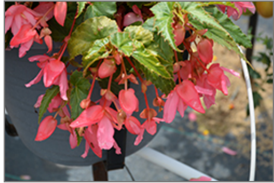
Funky Light Pink Begonia flowers

Funky Light Pink Begonia is a fine choice for the garden, but it is also a good selection for planting in outdoor containers and hanging baskets. It is often used as a 'filler' in the 'spiller-thriller-filler' container combination, providing a mass of flowers and foliage against which the thriller plants stand out. Note that when growing plants in outdoor containers and baskets, they may require more frequent waterings than they would in the yard or garden.