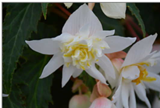
Funky White Begonia flowers

This is a relatively low maintenance plant, and should not require much pruning, except when necessary, such as to remove dieback. It is a good choice for attracting butterflies and hummingbirds to your yard, but is not particularly attractive to deer who tend to leave it alone in favor of tastier treats. Gardeners should be aware of the following characteristic(s) that may warrant special consideration;