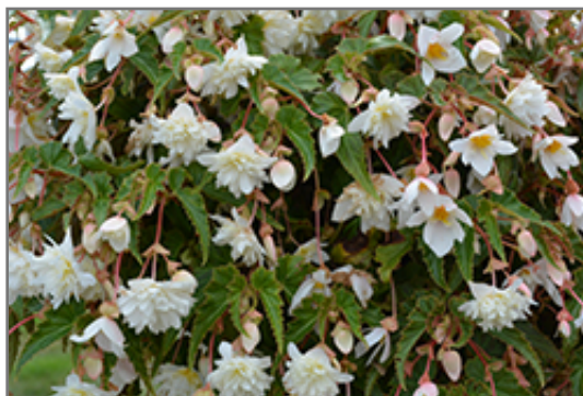
Funky White Begonia flowers

Funky White Begonia is a fine choice for the garden, but it is also a good selection for planting in outdoor containers and hanging baskets. It is often used as a 'filler' in the 'spiller-thriller-filler' container combination, providing a mass of flowers and foliage against which the thriller plants stand out. Note that when growing plants in outdoor containers and baskets, they may require more frequent waterings than they would in the yard or garden.