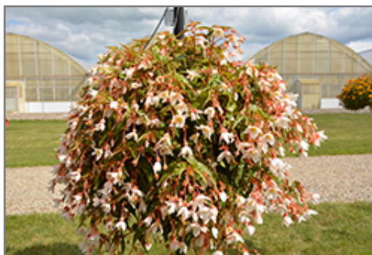
Funky White Begonia in bloom