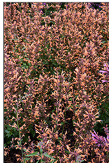
Sunrise Orange Hyssop flowers