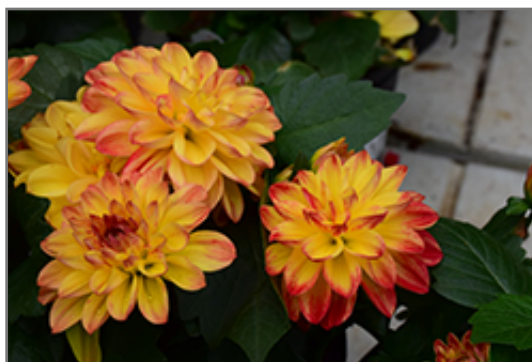
Hypnotica Tequila Sunrise Dahlia flowers