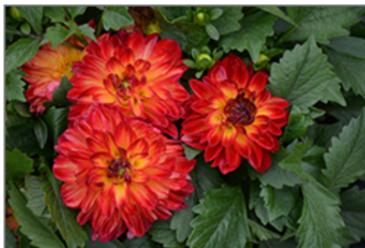
Hypnotica Tequila Sunrise Dahlia flowers

Hypnotica Tequila Sunrise Dahlia is recommended for the following landscape applications;