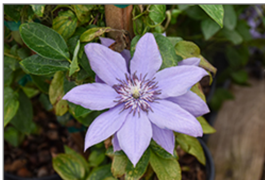
Bernadine Clematis flowers

This is a relatively low maintenance woody vine. It is a Type 2 clematis, which means it will bloom primarily on old wood of the previous season, with a second flush later in summer. Dead and weak vines should be removed in late winter, and remaining vines should be trimmed back to the first buds that are seen to remove dead stems. It is a good choice for attracting hummingbirds to your yard. It has no significant negative characteristics.