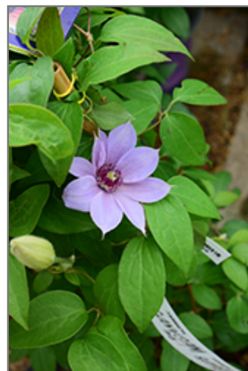
Bernadine Clematis flowers