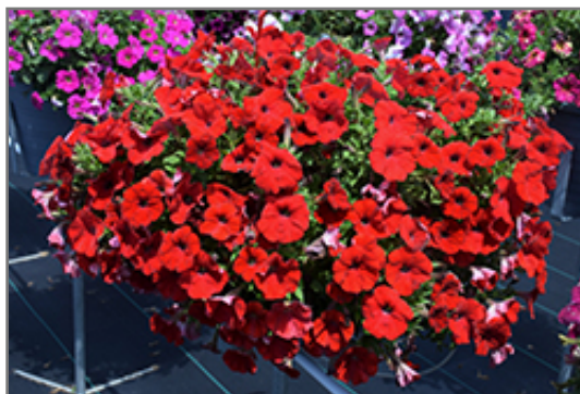
Capella Ruby Red Petunia in bloom

Capella Ruby Red Petunia will grow to be about 12 inches tall at maturity, with a spread of 16 inches. When grown in masses or used as a bedding plant, individual plants should be spaced approximately 12 inches apart. Its foliage tends to remain dense right to the ground, not requiring facer plants in front. This fast-growing annual will normally live for one full growing season, needing replacement the following year.