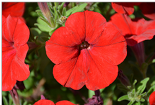
Capella Ruby Red Petunia flowers