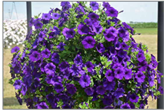
Dekko Blue Petunia in bloom

Dekko Blue Petunia will grow to be about 12 inches tall at maturity, with a spread of 22 inches. When grown in masses or used as a bedding plant, individual plants should be spaced approximately 18 inches apart. Its foliage tends to remain dense right to the ground, not requiring facer plants in front. This fast-growing annual will normally live for one full growing season, needing replacement the following year.