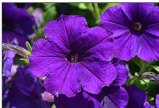
Dekko Blue Petunia flowers

Dekko Blue Petunia is recommended for the following landscape applications;