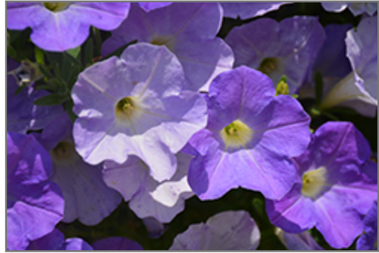
Dekko Sky Blue Petunia flowers

Dekko Sky Blue Petunia is a fine choice for the garden, but it is also a good selection for planting in outdoor containers and hanging baskets. Because of its spreading habit of growth, it is ideally suited for use as a 'spiller' in the 'spiller-thriller-filler' container combination; plant it near the edges where it can spill gracefully over the pot. Note that when growing plants in outdoor containers and baskets, they may require more frequent waterings than they would in the yard or garden.