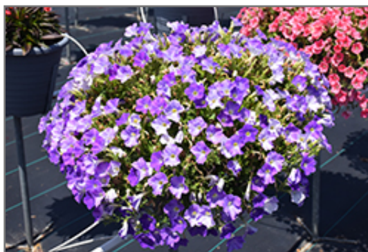
Dekko Sky Blue Petunia in bloom