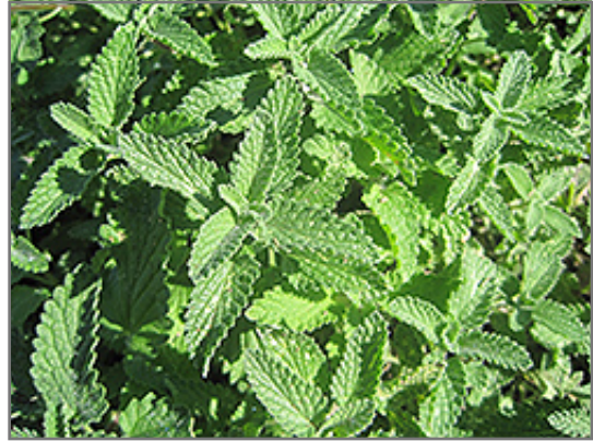
Walker's Low Catmint foliage

Walker's Low Catmint is a fine choice for the garden, but it is also a good selection for planting in outdoor pots and containers. It is often used as a 'filler' in the 'spiller-thriller-filler' container combination, providing a mass of flowers against which the thriller plants stand out. Note that when growing plants in outdoor containers and baskets, they may require more frequent waterings than they would in the yard or garden.