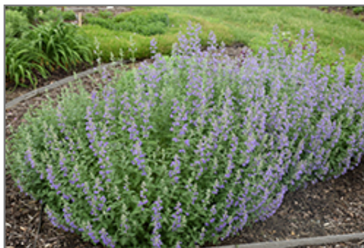
Walker's Low Catmint in bloom