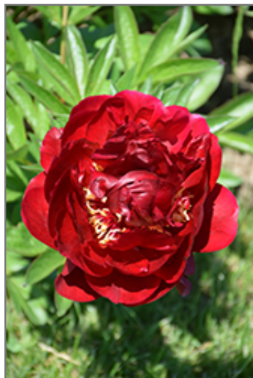
Buckeye Belle Peony flowers