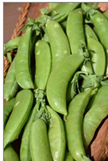
Sugar Snap Pea fruit

Sugar Snap Pea will grow to be about 6 feet tall at maturity, with a spread of 24 inches. When planted in rows, individual plants should be spaced approximately 24 inches apart. Because of its vigorous growth habit, it may require staking or supplemental support. This fast-growing vegetable plant is an annual, which means that it will grow for one season in your garden and then die after producing a crop.