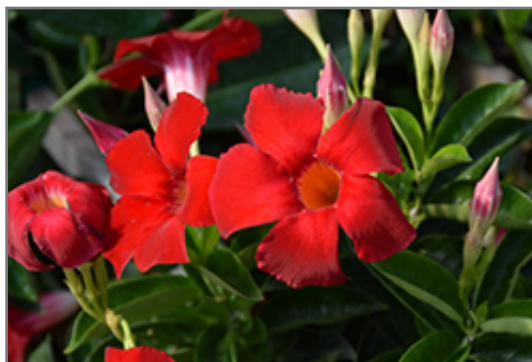
Sundenia Red Mandevilla flowers

This plant does best in full sun to partial shade. It requires an evenly moist well-drained soil for optimal growth. It is not particular as to soil type or pH. It is highly tolerant of urban pollution and will even thrive in inner city environments. This particular variety is an interspecific hybrid, and parts of it are known to be toxic to humans and animals, so care should be exercised in planting it around children and pets. It can be propagated by cuttings; however, as a cultivated variety, be aware that it may be subject to certain restrictions or prohibitions on propagation.