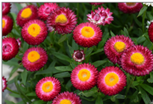
Cottage Rose Strawflower flowers