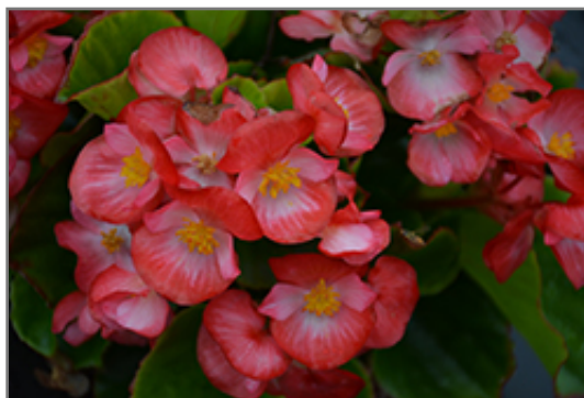
Sprint Plus Blush Begonia flowers

Sprint Plus Blush Begonia is recommended for the following landscape applications;