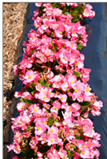
Sprint Plus Pink Begonia in bloom

Sprint Plus Pink Begonia is a fine choice for the garden, but it is also a good selection for planting in outdoor containers and hanging baskets. It is often used as a 'filler' in the 'spiller-thriller-filler' container combination, providing a mass of flowers against which the thriller plants stand out. Note that when growing plants in outdoor containers and baskets, they may require more frequent waterings than they would in the yard or garden.