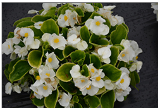
Sprint Plus White Begonia in bloom