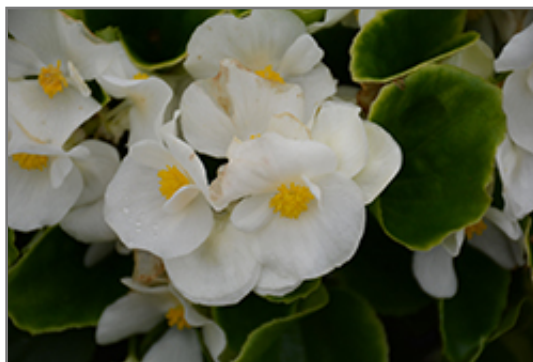
Sprint Plus White Begonia flowers

This is a high maintenance plant that will require regular care and upkeep, and usually looks its best without pruning, although it will tolerate pruning. Deer don't particularly care for this plant and will usually leave it alone in favor of tastier treats. Gardeners should be aware of the following characteristic(s) that may warrant special consideration;