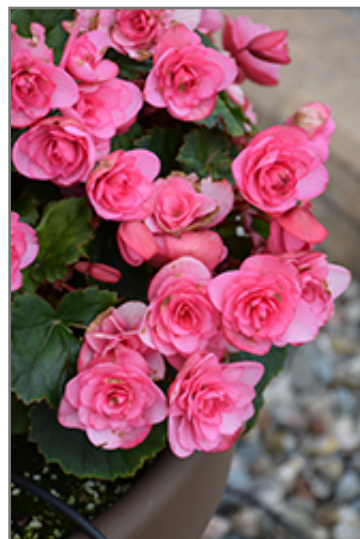
Frivola Pink Begonia flowers