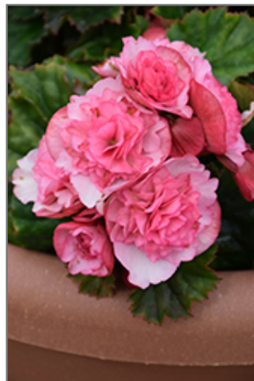
Frivola Pink Begonia flowers