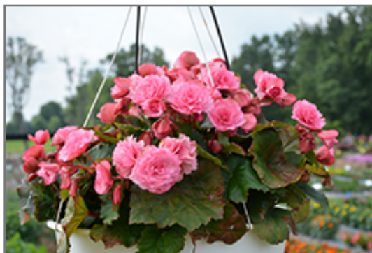
Frivola Pink Begonia in bloom

Frivola Pink Begonia will grow to be about 12 inches tall at maturity, with a spread of 12 inches. When grown in masses or used as a bedding plant, individual plants should be spaced approximately 8 inches apart. Its foliage tends to remain dense right to the ground, not requiring facer plants in front. Although it's not a true annual, this plant can be expected to behave as an annual in our climate if left outdoors over the winter, usually needing replacement the following year. As such, gardeners should take into consideration that it will perform differently than it would in its native habitat.