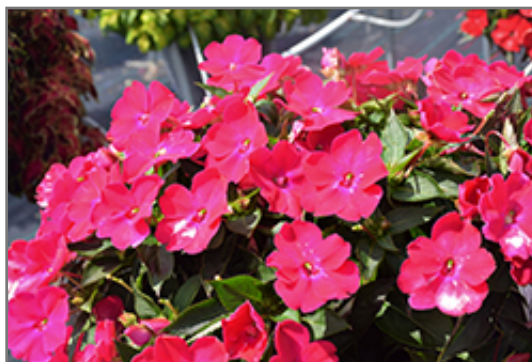
SunPatiens Compact Rose Glow New Guinea Impatiens flowers

SunPatiens Compact Rose Glow New Guinea Impatiens is recommended for the following landscape applications;