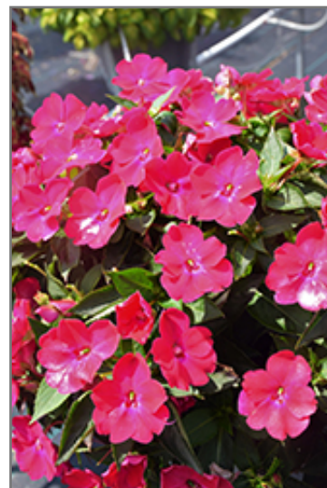
SunPatiens Compact Rose Glow New Guinea Impatiens flowers

SunPatiens Compact Rose Glow New Guinea Impatiens is a fine choice for the garden, but it is also a good selection for planting in outdoor containers and hanging baskets. It can be used either as 'filler' or as a 'thriller' in the 'spiller-thriller-filler' container combination, depending on the height and form of the other plants used in the container planting. It is even sizeable enough that it can be grown alone in a suitable container. Note that when growing plants in outdoor containers and baskets, they may require more frequent waterings than they would in the yard or garden.