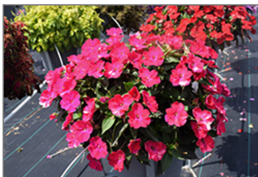
SunPatiens Compact Rose Glow New Guinea Impatiens in bloom