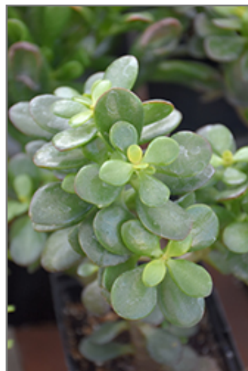
Baby Jade Plant foliage

This is a multi-stemmed evergreen houseplant with an upright spreading habit of growth. This plant can be pruned at any time to keep it looking its best.