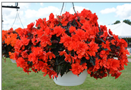
I'Conia Portofino Coral Begonia in bloom