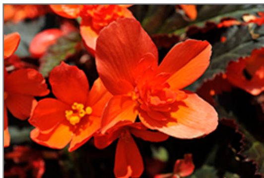
I'Conia Upright Fire Begonia flowers

I'Conia Upright Fire Begonia is recommended for the following landscape applications;