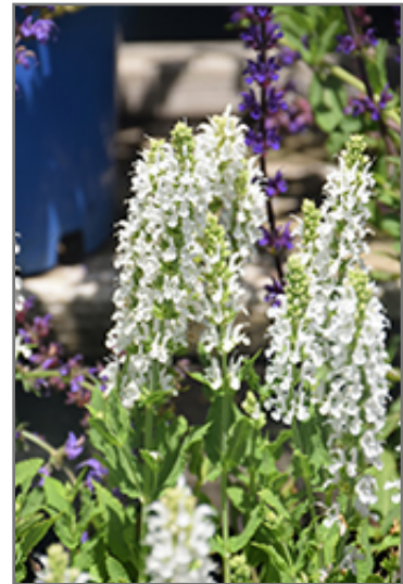
Snow Hill Sage flowers

Snow Hill Sage is a fine choice for the garden, but it is also a good selection for planting in outdoor pots and containers. It is often used as a 'filler' in the 'spiller-thriller-filler' container combination, providing a mass of flowers against which the larger thriller plants stand out. Note that when growing plants in outdoor containers and baskets, they may require more frequent waterings than they would in the yard or garden.