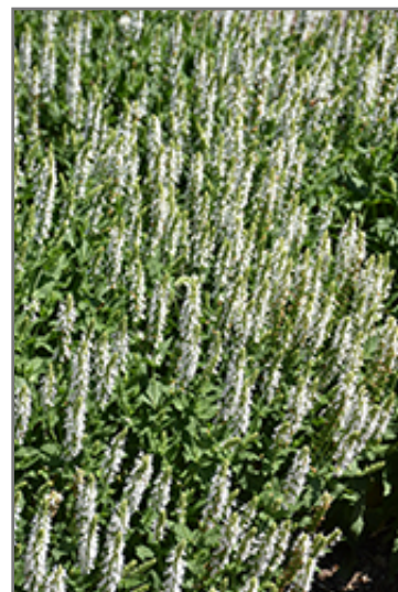
Snow Hill Sage flowers

Snow Hill Sage is recommended for the following landscape applications;