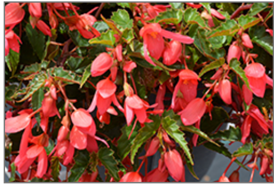
Groovy Rose Begonia flowers