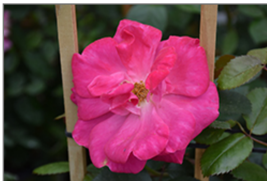
Highwire Flyer Rose flowers