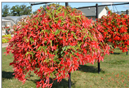
Bossa Nova Rose Begonia flowers