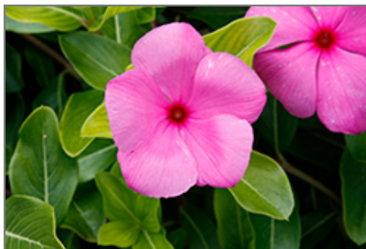
Cora Cascade Lilac Vinca flowers

Cora Cascade Lilac Vinca is recommended for the following landscape applications;