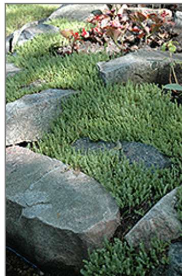
Six Row Stonecrop