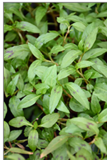
Vietnamese Coriander foliage

A visually appealing and delicious culinary herb; perfect addition to gardens and patio containers; features green pointy foliage with interesting burgundy streaks; lemony flavor with a pepper punch, commonly used for salads, soups and stews