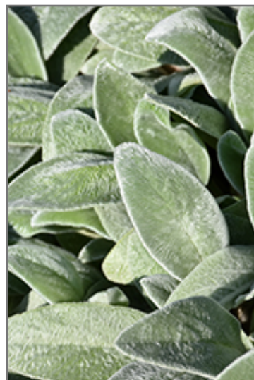
Lamb's Ears foliage

Lamb's Ears is recommended for the following landscape applications;