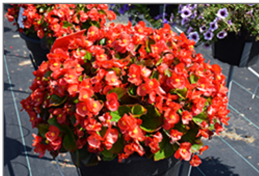
Super Cool Red Begonia in bloom