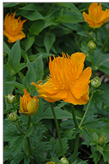
Golden Queen Globeflower flowers

Golden Queen Globeflower will grow to be about 30 inches tall at maturity, with a spread of 24 inches. When grown in masses or used as a bedding plant, individual plants should be spaced approximately 18 inches apart. It grows at a medium rate, and under ideal conditions can be expected to live for approximately 10 years. As an herbaceous perennial, this plant will usually die back to the crown each winter, and will regrow from the base each spring. Be careful not to disturb the crown in late winter when it may not be readily seen!