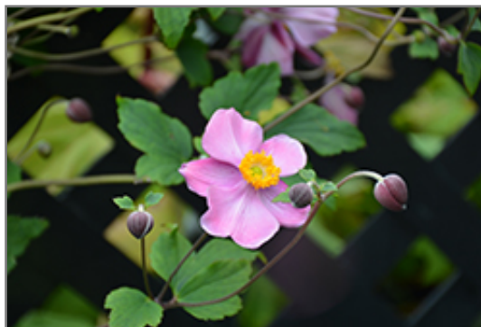
Grapeleaf Anemone flowers