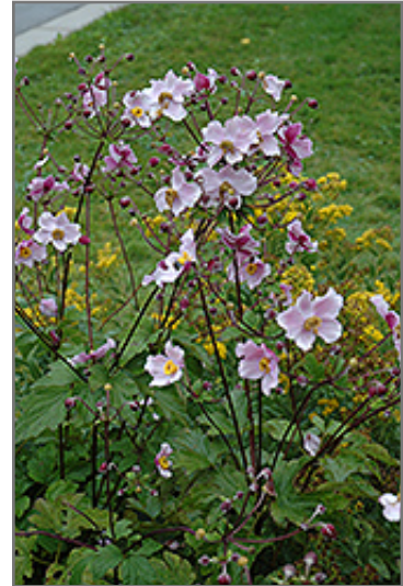
Grapeleaf Anemone flowers

This plant does best in full sun to partial shade. It prefers to grow in average to moist conditions, and shouldn't be allowed to dry out. It is not particular as to soil pH, but grows best in rich soils. It is somewhat tolerant of urban pollution. Consider applying a thick mulch around the root zone over the growing season to conserve soil moisture. This is a selected variety of a species not originally from North America. It can be propagated by division; however, as a cultivated variety, be aware that it may be subject to certain restrictions or prohibitions on propagation.