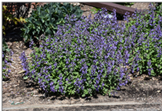
Picture Purrfect Catmint in bloom