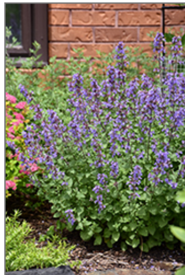
Picture Purrfect Catmint flowers

Picture Purrfect Catmint is a dense herbaceous perennial with a mounded form. Its relatively fine texture sets it apart from other garden plants with less refined foliage.