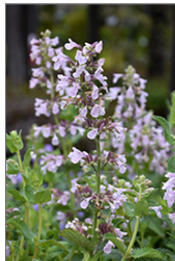
Whispurr Pink Catmint flowers