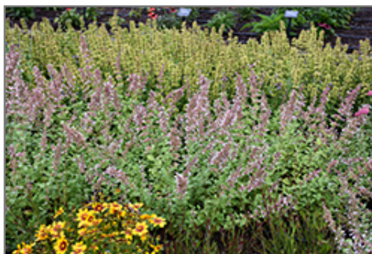
Whispurr Pink Catmint in bloom