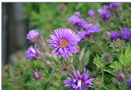
Grape Crush New England Aster flowers